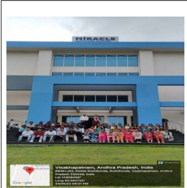
II CSE - A