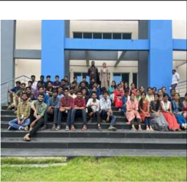
II CSE - B