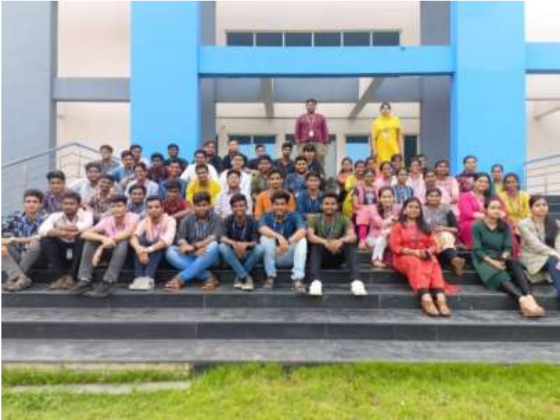
II CSE - C