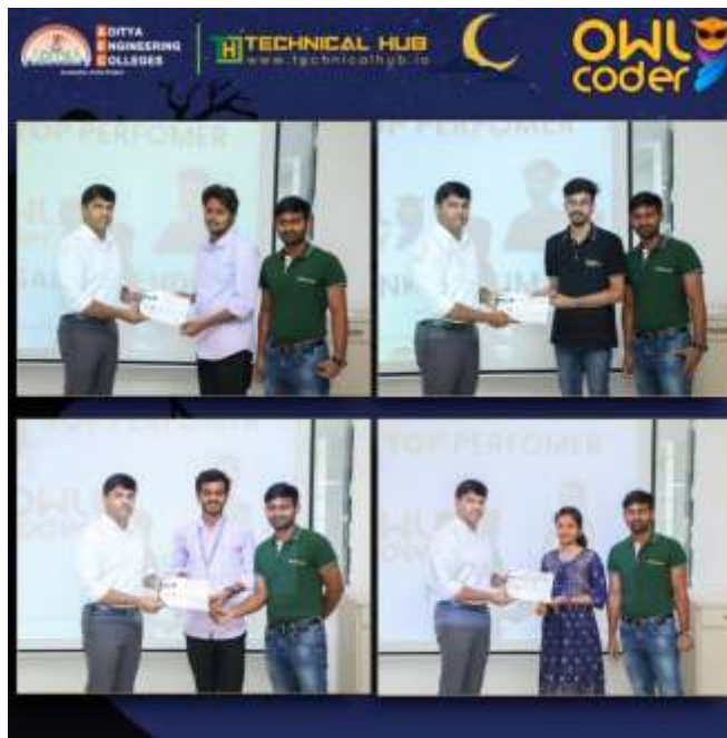
Coding Contest-5 Winner Conducted by Thub,AEC on 29/05/2022